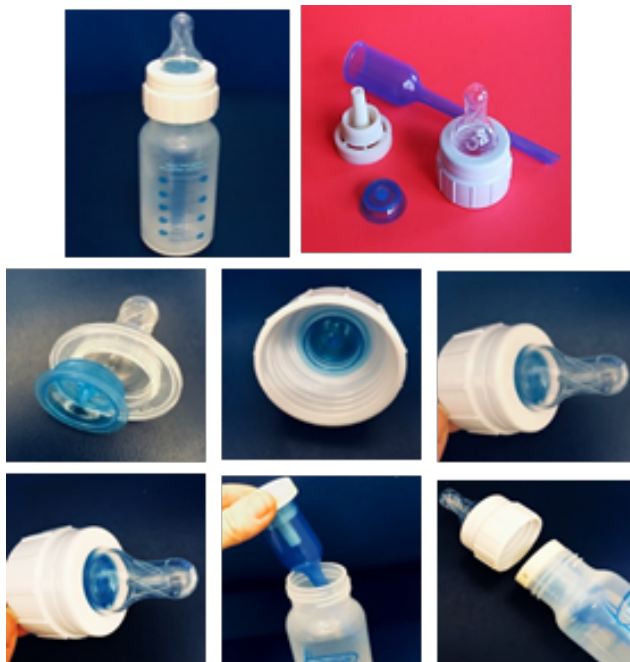
Figure 3: Dr. Brown's® Specialty Feeder Nipple Assembly

ring attached (Figure 3). There is a “Fill line” warning and it is important not to overfill the bottle. It is better to swirl the formula to mix it rather than shaking to minimize bubbles. When attaching the nipple ring, closing it too tightly may prevent the valve system from working. If it is too loose the ring can leak. This is true for all the valve-based systems. It is recommended that the system be primed by squeezing the nipple, inverting the bottle, then releasing the nipple. This allows milk to flow into the nipple through the valve. Once primed, the action of feeding will allow the nipple to keep filling. Additional resources for feeding therapists and families can be found at drbrownsbaby.com.