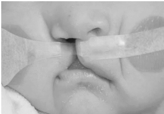
Figure 7: Example of Cleft Lip Taping with DynaCleft® Positioning Strips (more information available at https://www.cranio rehab.com/DynaCleft ).

serve as a fence or border to prevent excessive jaw movement. It is important to note that some jaw movement is normal so the finger should not be used to restrict all movement. For infants with wide clefts of the lip taping may be recommended. Lip taping can be performed with Steri-Strips™ or half-inch paper tape placed across the lip after gentle compression of the lip segments together. There are also commercially available products designed specifically for cleft lip taping. Lip taping can support orbicularis oris functioning for successful latch and compression of the nipple during active feeding (Figure 7). Over several weeks' time lip taping can also help to passively narrow a wide cleft considerably which can make feeding and eventual surgery easier.