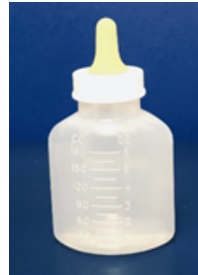
Figure 6: Mead Johnson™ Cleft Nurser.

than US$3 each but must be special ordered. Some authors suggest this bottle system is favorable because of its ease of use [46]. In our experience, this bottle is the best option when thickened liquids are required because the valve systems typically do not work well with most thickening agents. For ordering information see www.enfamil.com/shop .