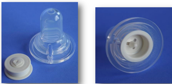
Figure 5: Pigeon Bottle Nipple Assembly.

To assemble the Pigeon system, the one-way valve is placed into the nipple. The flat side faces into the nipple and the pointed stem faces down into the bottle. The valve should sit flush with the bottom of the nipple. The nipple can then be inserted into the nipple ring (Figure 5). The ring-nipple-valve assembly is then attached to the filled bottle. As with all these systems, if the ring is placed too tightly the valve may not function well and if it is too loose the bottle will leak. The nipple is primed by squeezing it and inverting the bottle to draw milk into the nipple. There is a notch located on one side of the nipple (The firmer half) and this notch is pointed towards the nose to orient the nipple appropriately. There is officially only one flow rate for this system, but some providers note that if you turn the nipple a quarter turn so the notch is directed toward the oral commissure the flow rate can be decreased. More information is available at https://clefline.org/wp-content/uploads/2018/10/Pigeon-Cleft-Palate-Nipple-System-Product-Improvements-Information-Sheet._-003.pdf .