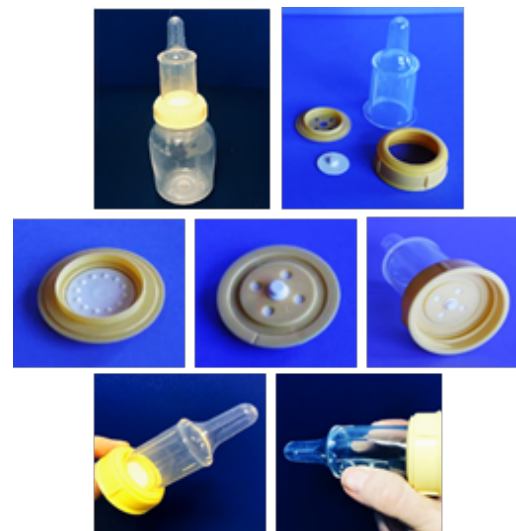
Figure 4: Medela SpecialNeeds Feeder® Nipple Assembly.

To assemble the valve, the white rubber disk membrane is pressed into the upper side of the larger yellow hard plastic disk until the membrane stud goes through the center hole. The clear nipple is then placed into the nipple collar (Yellow ring). The valve components are then placed into the nipple-ring assembly. The white membrane should face the top of the nipple and the stud face towards the bottle and away from the nipple (Figure 4). The bottle can be filled and primed similarly to the Dr. Brown's® system although two or three squeezes and inversions of the bottle may be required to fill the nipple half to three-quarters full.